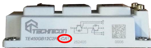
Fig. 2. IGBT C2 case with BIN A1 group marking

Sample: V_F tolerance of BIN groups of IGBT TE450GB12C5R7 is shown in Table 2.